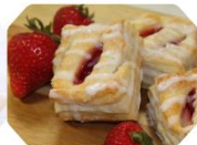
PASTRY PUFFINS Cherry Blueberries & Cream Cinnamon Cream Cheese and more!