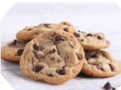
CLASSIC COOKIES Chocolate chip Snickerdoodle Peanut Butter and more!