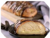
BUTTER BRAIDS Bavarian Creme Strawberries & Cream Apple, Blueberry 4 Cheese & herb +many more!

Forms and payment are due by March 20 th !