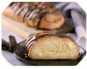
BUTTER BRAIDS Bavarian Creme Strawberries & Cream Apple, Blueberry 4 Cheese & herb +many more!