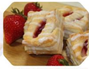
PASTRY PUFFINS Cherry Blueberries & Cream Cinnamon Cream Cheese and more!