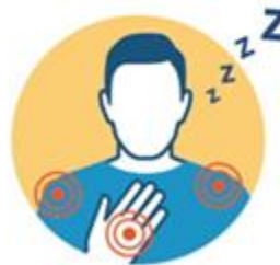
MUSCLE PAIN AND FATIGUE