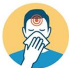
CONGESTION OR RUNNY NOSE